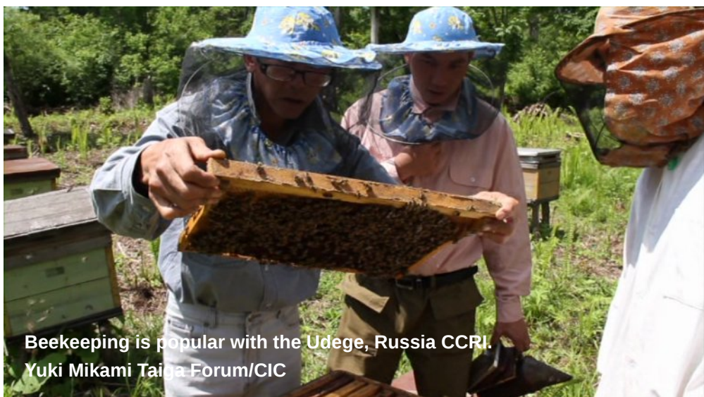
Beekeeping is popular with the Udege, Russia