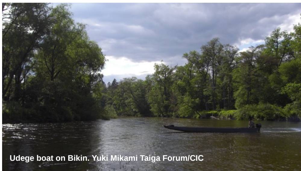
Udege boat on Bikin.

called for the creation of the Bikin National Park as a co-managed protected area with effective indigenous participation and the correction of federal legislation; and to recreate the indigenous division in the Udege Legend National Park and ensure its management complies with the law. Communities need to be educated about existing biodiversity and about current regulations in fishing and hunting, and governmental agencies need to properly recognise, respect and support indigenous conservation practices, traditional knowledge and related privileges.