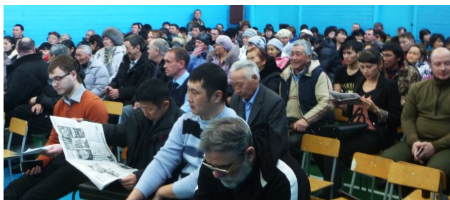
Hearings on Bikin national park model, Udege town of Krasny Yar, March 2015.