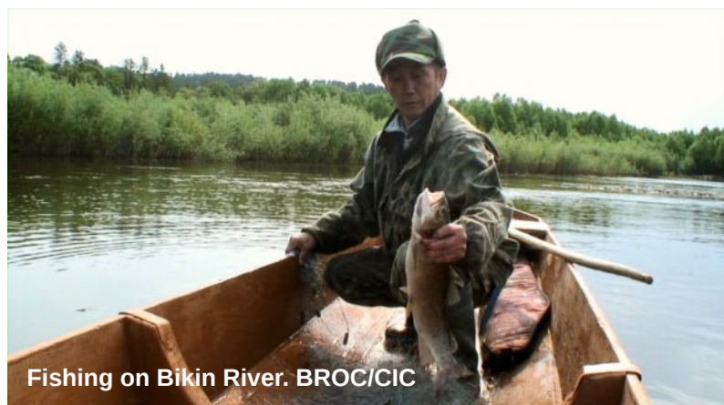
Fishing on Bikin River.

Russian law formally recognises the existence of indigenous territories [5] and grants native peoples special hunting [6] and fishing [7] rights. However, there is a serious discrepancy between formal rights and law enforcement and management in practice, leading to deep conflicts around indigenous priorities. Regulations regarding indigenous privileges are overly complicated, unclear, and often changed without informing the communities.