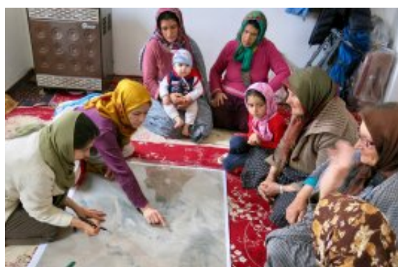
CCRI Iran. Cenesta