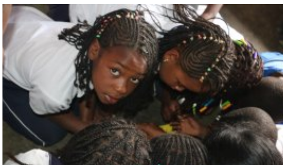
CCRI Colombia. CENSAT/GFC