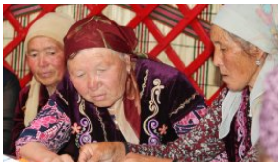
CCRI Kyrgyzstan. BIOM/GFC