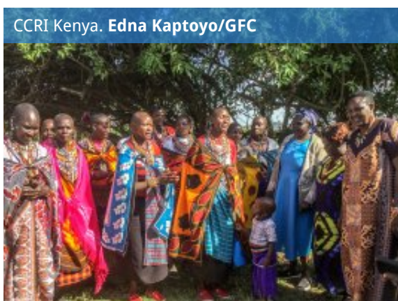
CCRI Kenya.