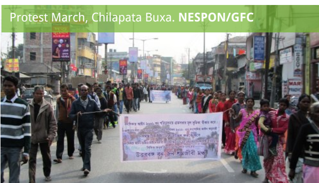
Protest March, Chilapata Buxa. NESPON/GFC

that is undermining the pastoral practices. With restrictions on the movement of pastoralists with their animals, the male animals have been left with little economic value. This has affected the pastoral livelihoods and led to increasing dependence on the milk economy: Maldharis have become milkmen instead of breeders. This has led to a greater dependence on external markets for water and fodder for their animals. Simultaneously, there is an increase in the number of animals in the grasslands that threatens to exceed its carrying capacity.