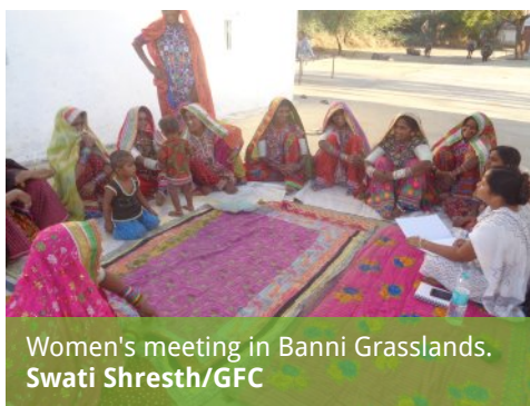
Women's meeting in Banni Grasslands.