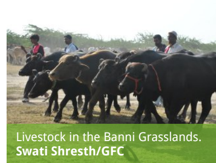
Livestock in the Banni Grasslands.