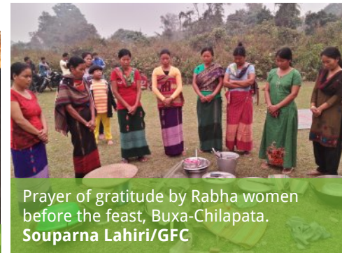
Prayer of gratitude by Rabha women before the feast, Buxa-Chilapata.