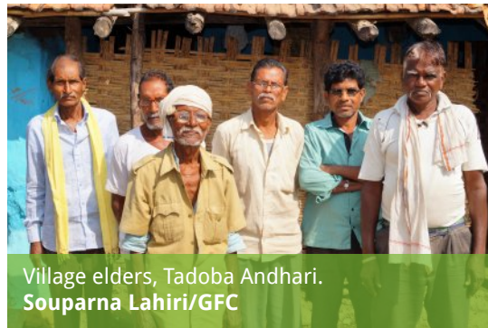
Village elders, Tadoba Andhari.