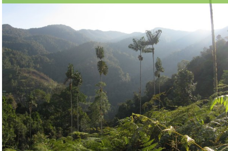
Surrounding environment, Barbas de Mono Reserve. Fundaexpresión and Censat Agua Viva/GFC