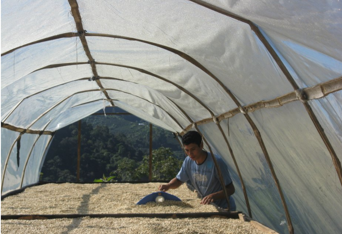
Drying seeds, Barbas de Mono Reserve.

dependency and imposing conditions that actively prevent food sovereignty within the communities. The problem in this regard is addressed by several authors. [10]