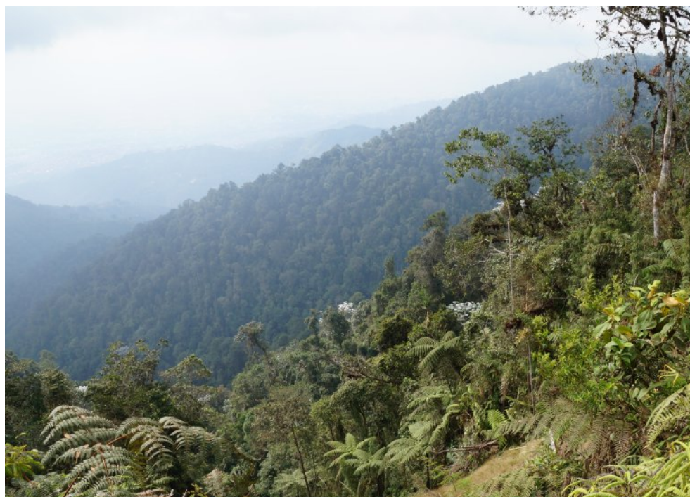
Environment around Los Maklenkes Reserve. Fundaexpresión and Censat Agua Viva/GFC

able to address them. In their situation, which is similar to that of hundreds of communities in Colombia, the main threats inherent in the dominant development model and the implementation of the peace agreements are: