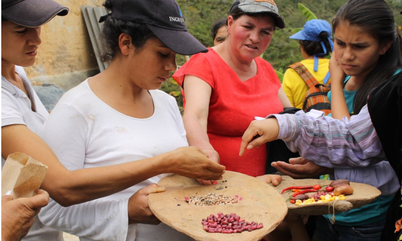
Seed-saving in Barbas de Mono Reserve.

The Los Maklenkes community identified the erosion of traditional knowledge and practices as a threat to their biodiversity, heritage and culture. Similarly, for the community that manages the Barbas de Mono