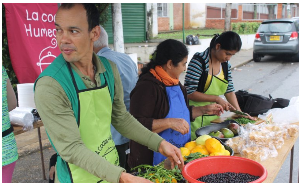
Preparing food, Los Maklenkes Reserve.