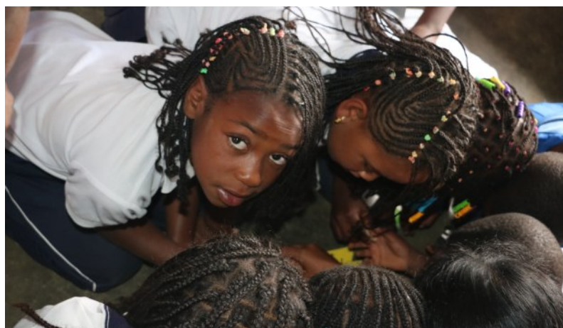
Children participate in CCRI assessment, La Alsacia Community Council.

In Colombia, decades of armed conflict have seriously impacted communities and their capacity to conserve their territories. The most common reaction has been the