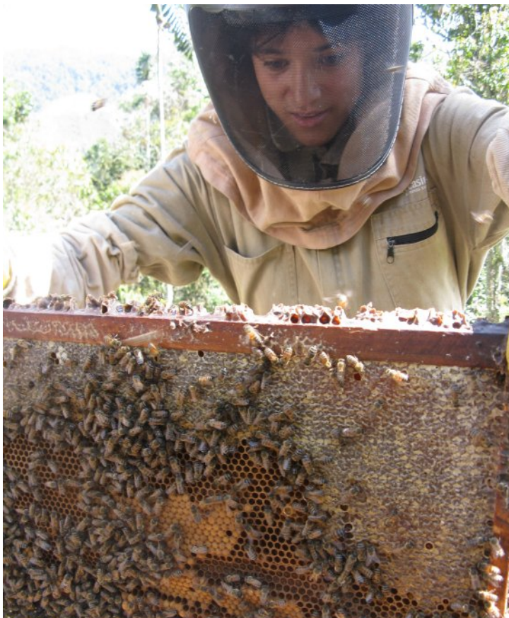
Beekeeping in Barbas de Mono Reserve. Fundaexpresión and Censat Agua Viva/GFC

potential privatisation of community managed aqueducts, and community co-optation by mining companies (resulting in a lack of interest from other families in organisational and resistance processes). In this context, they felt that territories and communities are vulnerable to specific threats such as: