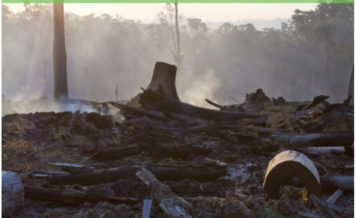
Forest destruction in Australia.