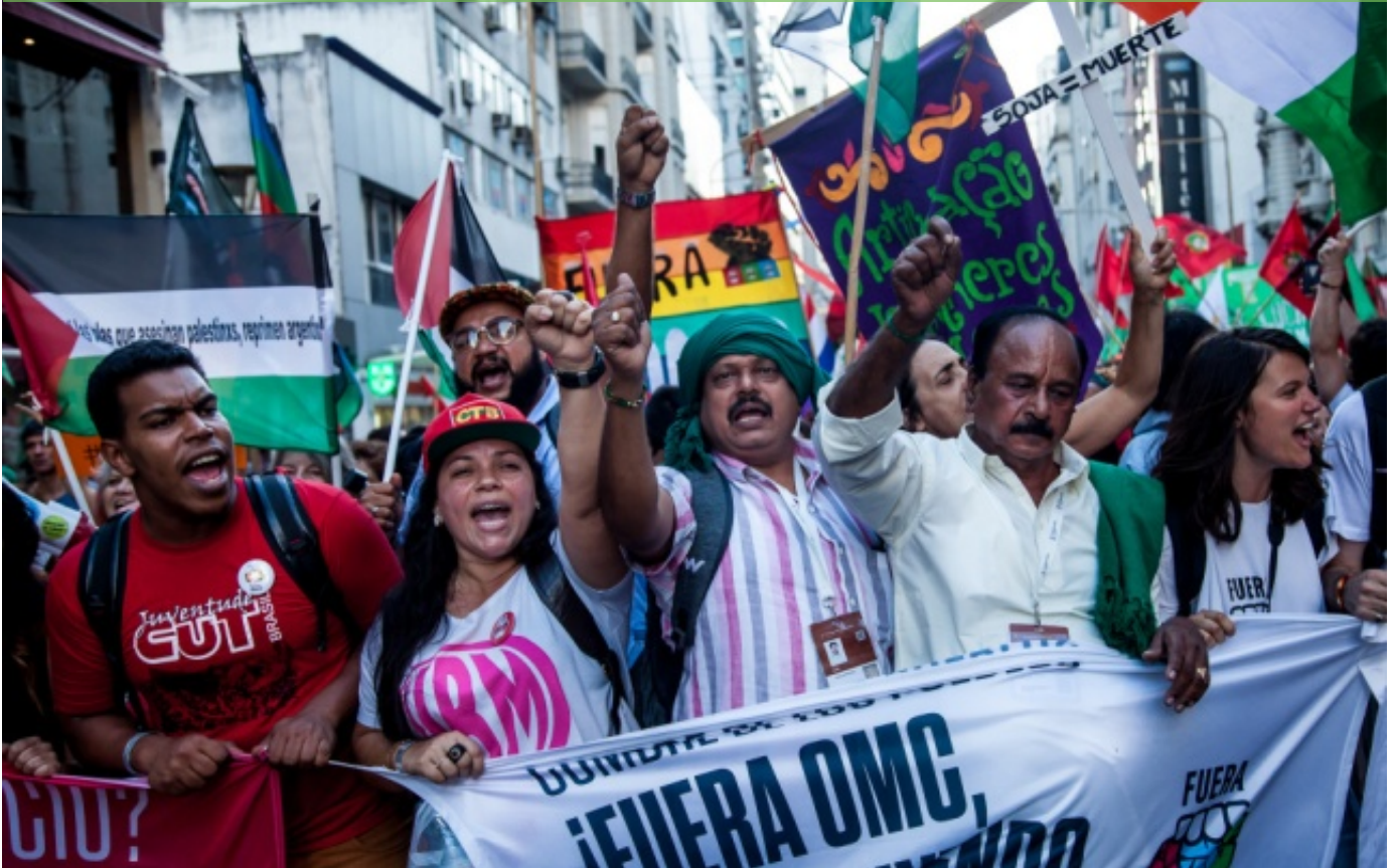
Protesters target the WTO in Buenos Aires, Argentina.

dispossession of land of communities, forest dependent peoples and Indigenous Peoples, as well as human health and animal welfare impacts. [2] For example, the 2016 State of the World's Forests report refers to an analysis in seven South American countries which found that 71% of deforestation between 1990 and 2005 was driven by increased demand for land while in Brazil the figure was even higher, at 80%.