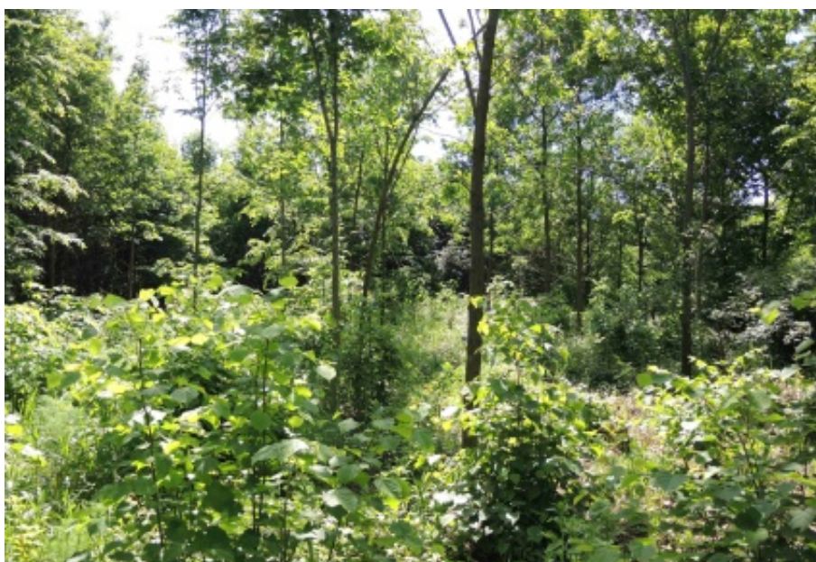
A coppiced woodland. Koalice pro řeky

wood on the spot in the damaged mountain catchments, to prevent soil erosion, enhance soil fertility, and enable stream and wetland restoration. Our mountain forests should be protected.