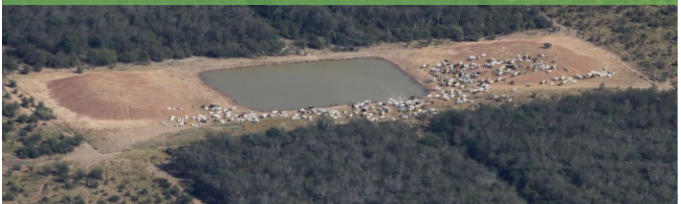
Deforestation for cattle ranching in the Chaco, Paraguay.

A news article about the recent rounds of negotiations said: “At its heart, any agreement will depend on beef and ethanol—but mainly the beef. If Europe agrees to buy enough prime Latin American beef at low tariff levels, Mercosur will drop tariffs on leading EU exports such as cars and machinery.” [1] What Mercosur wants is to export prime meat to the EU. This with ethanol is one of its biggest ambitions. When one hears this one could think that the