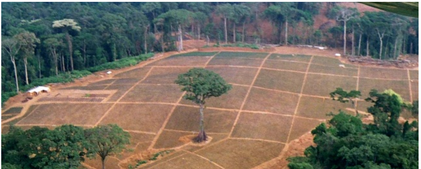
A newly-planted palm oil plantation in Cameroon. Center for Environment and Development