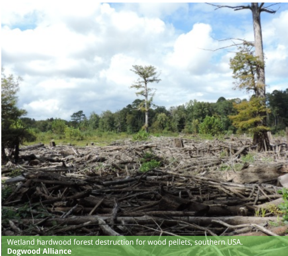
Wetland hardwood forest destruction for wood pellets, southern USA.

bottomland hardwood forests. [4] According to the Southern Environmental Law Center, over 168,000 acres of wetland forest were at high risk from just this one facility. [5] Enviva ships much of the pellets they produce to the DRAX coal plant in UK, which has been converted to burn 50% wood pellets. In 2016, DRAX burned 6.6 million tonnes of pellets, [6] made from 13.2 million tonnes of wood (since two tonnes of wood are harvested for every tonne of pellets manufactured).