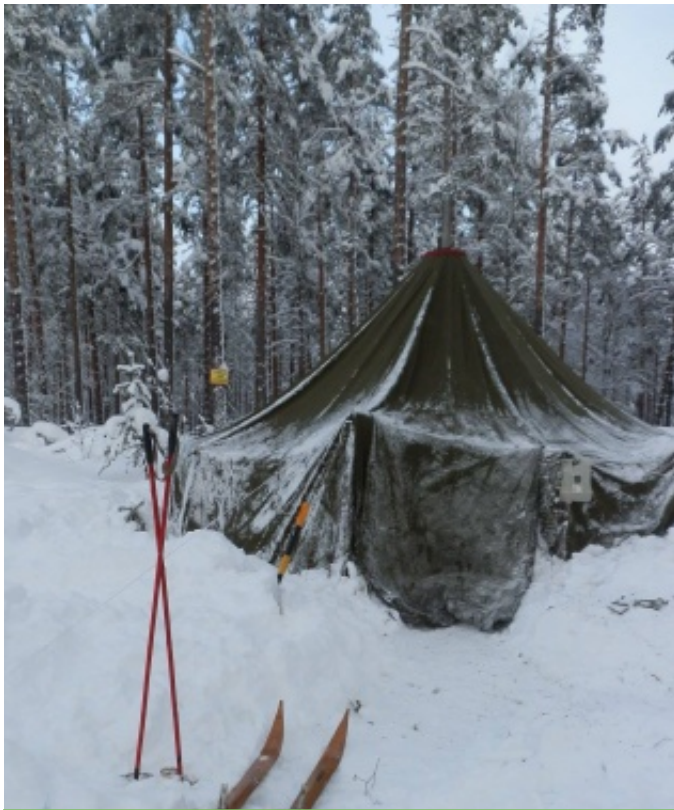
A tent for volunteers protecting the Ore Forest Landscape. Pär Wetterrot