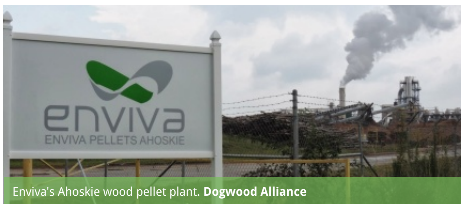
Enviva's Ahoskie wood pellet plant.

An exposé of wood sourcing practices for the pellet manufacturer, Enviva, the largest producer in the US, revealed they were in fact harvesting whole trees from rare remaining pockets of