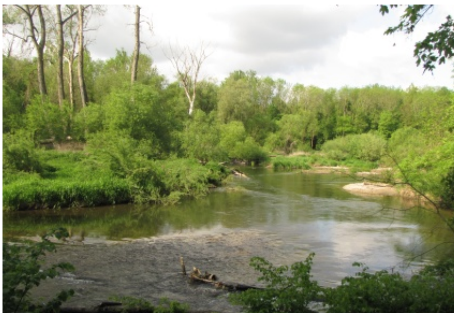
A natural floodplain. Koalice pro řeky