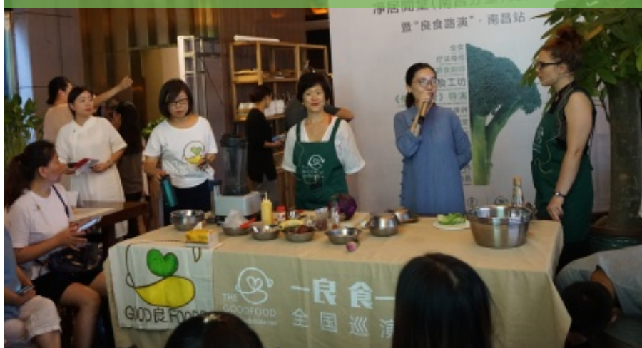
The final Good Food Roadshow workshop in Nanchang. Brighter Green