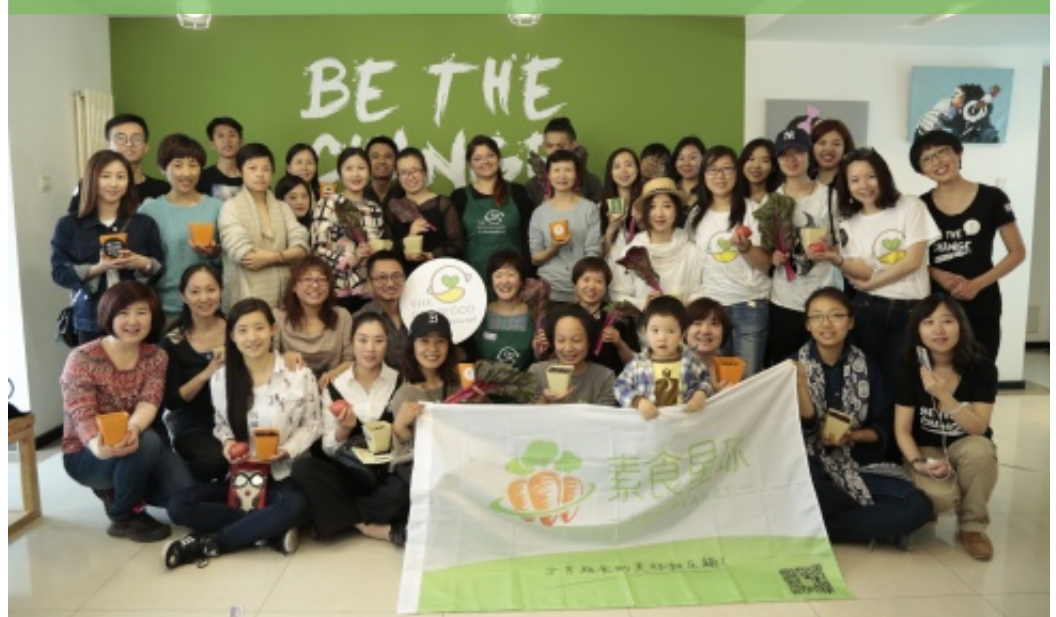
The Good Food Roadshow team with participants at one of the workshops in Beijing.

factory farming” linking the world’s three biggest players in the meat industry—the US, China, and Brazil—and analysing the dynamics shaping this triangle. These dynamics include industrial-scale cattle ranching and growing soybeans for animal feed, which contribute to extensive deforestation in countries such as Brazil and Paraguay.