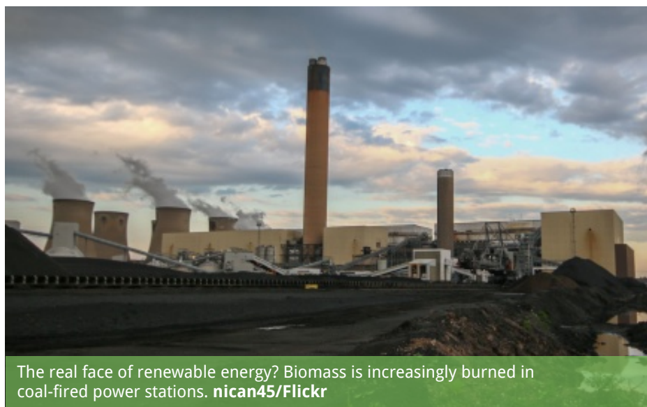
The real face of renewable energy? Biomass is increasingly burned in coal-fired power stations.

Furthermore, wood bioenergy can provide 'baseload' power (24/7, year round), thus putting off the need to invest in the electricity storage and interconnectors which are needed to make 100% 'no-burn' renewables viable. In addition, public sentiment towards burning wood as renewable energy has been favourable. It is viewed by the public and even environmentalists as 'natural'. Many environmental organisations initially promoted biomass enthusiastically, even those that later shifted their position on ethanol as competition with food production was recognised. With mandated targets and subsidies in place, it seemed clear that wood biomass would be the 'low hanging fruit' for renewables and would rapidly expand on a large scale. And it has.