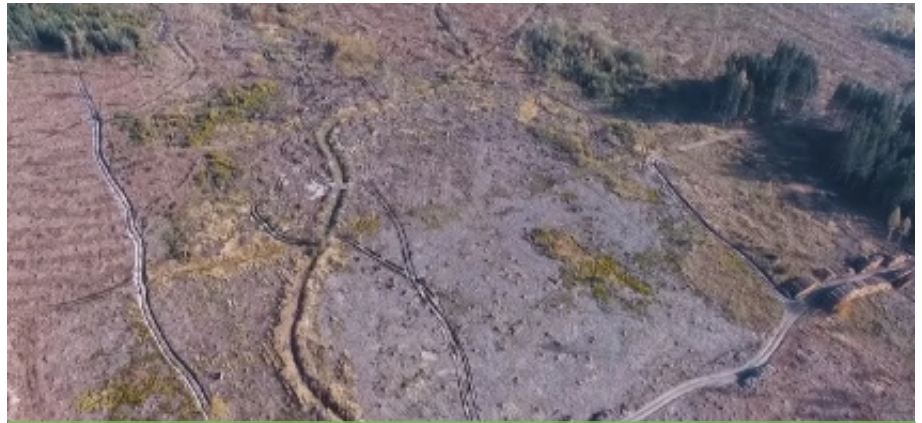
Damage to wetland environments caused by logging. Koalice pro řeky

The production of wood biomass is also a pressing concern. Remains of