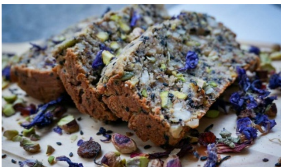
Vegan Energizing Nutty Bread made with local ingredients at Good Food Roadshow workshop in Taipei. Brighter Green