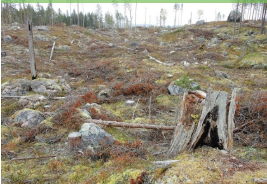
Ore Forest Landscape, after logging by Sveaskog.

full of red-listed species, are being cut down. All the work we have done is lost!"