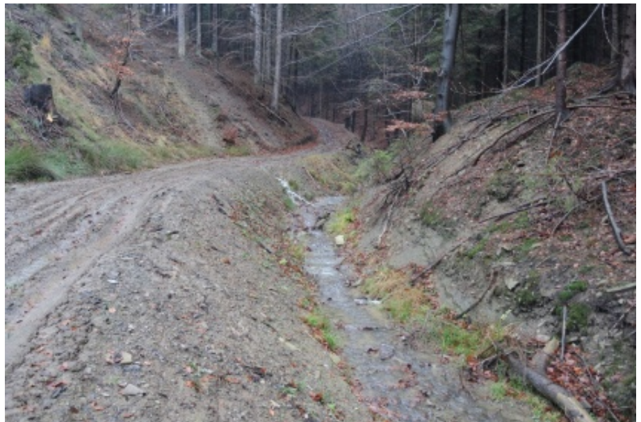
Transporting wood in floodplain plantations degrades water courses. Koalice pro řeky

our 'close to nature' beech forests were destroyed in the 18 th century when wood was used to power all kinds of early industrialisation. Due to prevailing ideas from the Austrian forestry school, natural forests were replaced by spruce monoculture plantations. Nowadays, however, these spruce plantations frequently die due to dry summers, storms and infestations of bark beetle. The beetle infestations in northern Moravia have reached unprecedented levels. Thousands of hectares of trees have been damaged and heavy machinery is being used to fight the bark beetle outbreak.