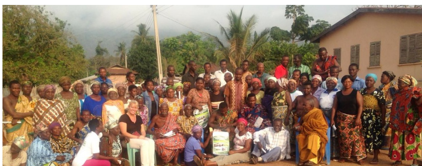
Community conservation meeting in the Saviefe-Gbgame community, Ghana.

There was an excellent interaction between young and old, and women and men. Some of the young people were surprised when they found out about the origin of their community's cultural practices. All the results were fed into a national validation, learning and advocacy workshop, which included further capacity building.