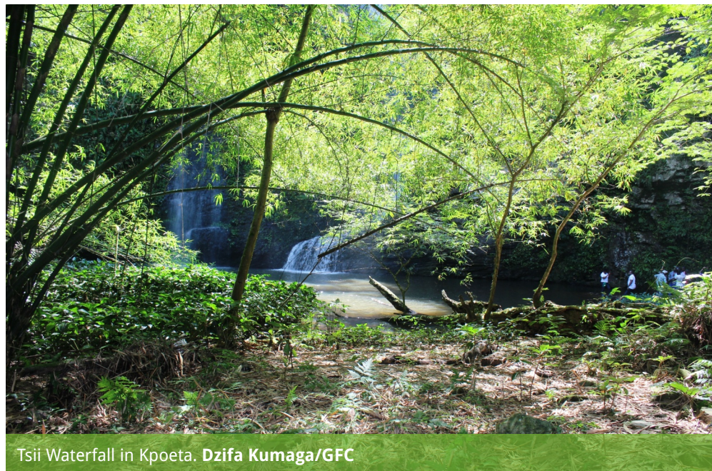
Tsii Waterfall in Kpoeta.

The community in Avuto identified the commercial use of monofilament nets as a threat to sustainable fishing, and youth unemployment. Other