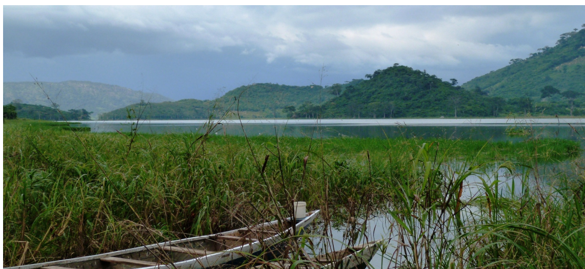
Weto landscape.