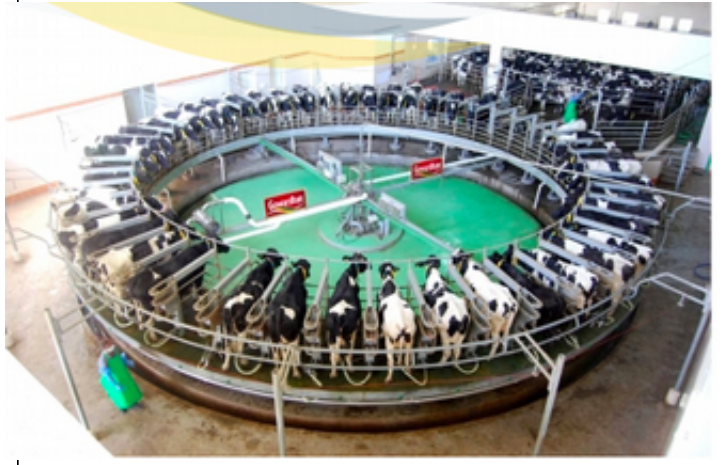
Bhagyalaxmi dairy farm – India's first CAFO (Source: Gowardhan, 2016).

Recently there is also a growth in mega milk factories based on the concentrated animal feeding operation (CAFO) model by foreign investors who need to tie up with local companies in order to directly produce milk. Most of these Indian companies come from unrelated sectors like mining or real estate (Bhosale, 2010). This dairy boom in India is based on the organized sector vying to capture the massive unorganized milk sector of the country—70% of the total dairy sector falls out of