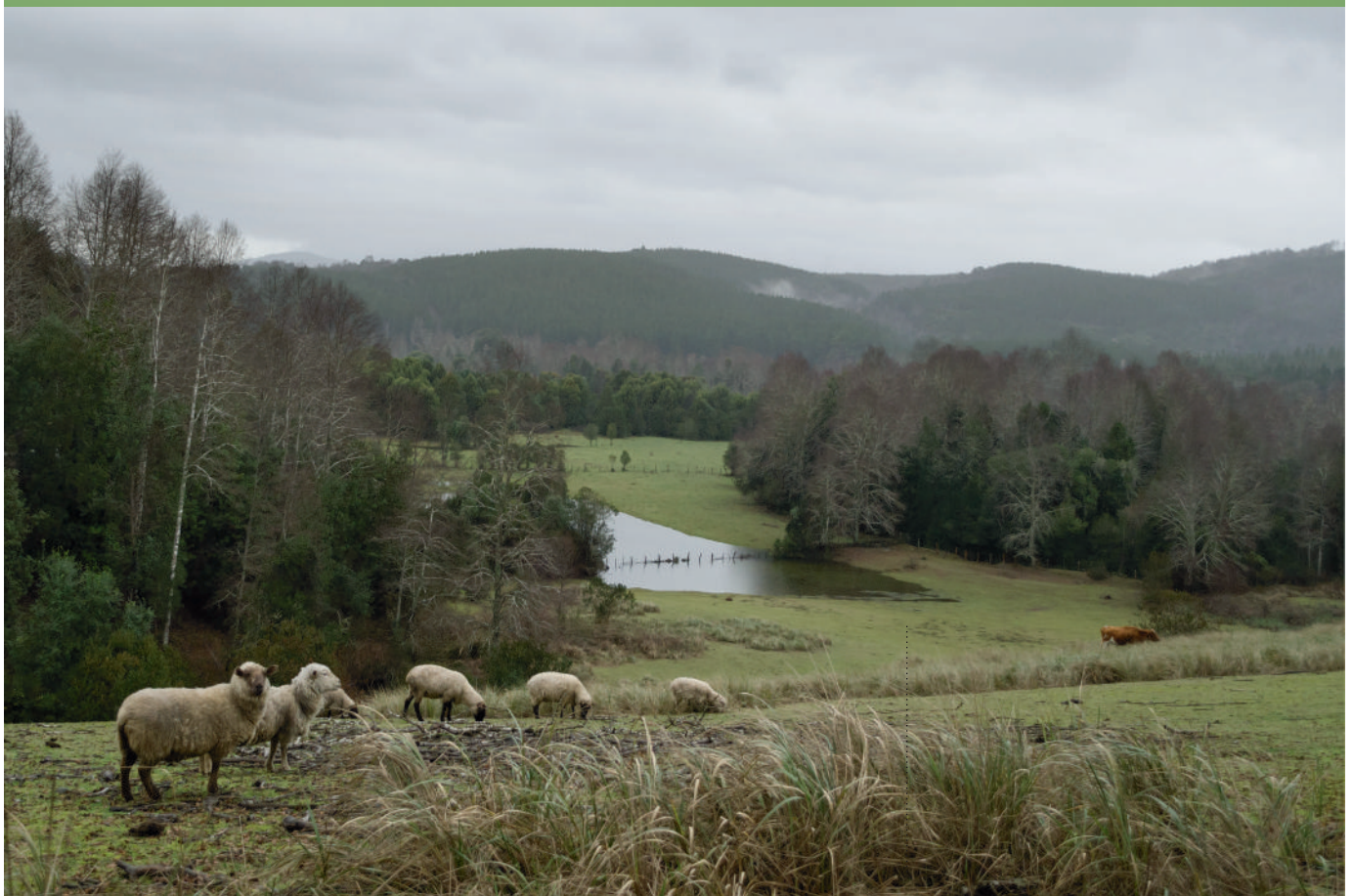
Contrasting deciduous forests and monoculture pine plantations in Chile. Carolina Lagos/CIC

The main problems associated with forestry expansion are experienced by peasant communities and indigenous peoples in general, and the Mapuche people in particular, who have been displaced and are unable to maintain their traditional economies, ancestral practices and ways of life, due to the various negative impacts of forest plantations and associated industries on ecosystems.