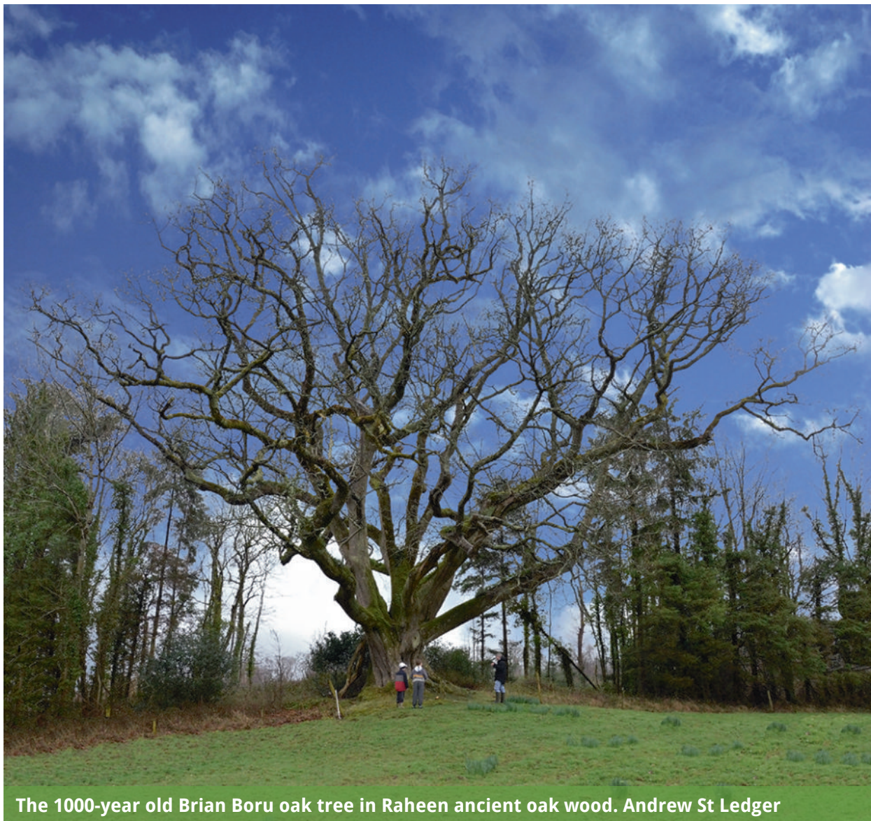
The 1000-year old Brian Boru oak tree in Raheen ancient oak wood. Andrew St Ledger

other countries, seeking funding under the EU Horizon 2020 research funding programme. Unfortunately the project did not get past the second stage this time but we are confident of obtaining funding in the near future. Either way we are continuing with small amounts of funding and much goodwill, on the understanding that this train is moving forward with one very valuable by-product, Community Restoration!