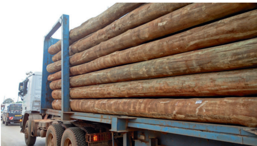
A Green Resources truck with its load of timber, Uganda. Carbon Violence

There are also human rights violations associated with the establishment of these plantations, For example, Global Woods has been accused of violations in Kikonda, [3] including arbitrary arrests, the confiscation of cattle, and widespread corruption amongst forest rangers employed by the company. Affected communities have taken the company to court over land grabbing.[4]