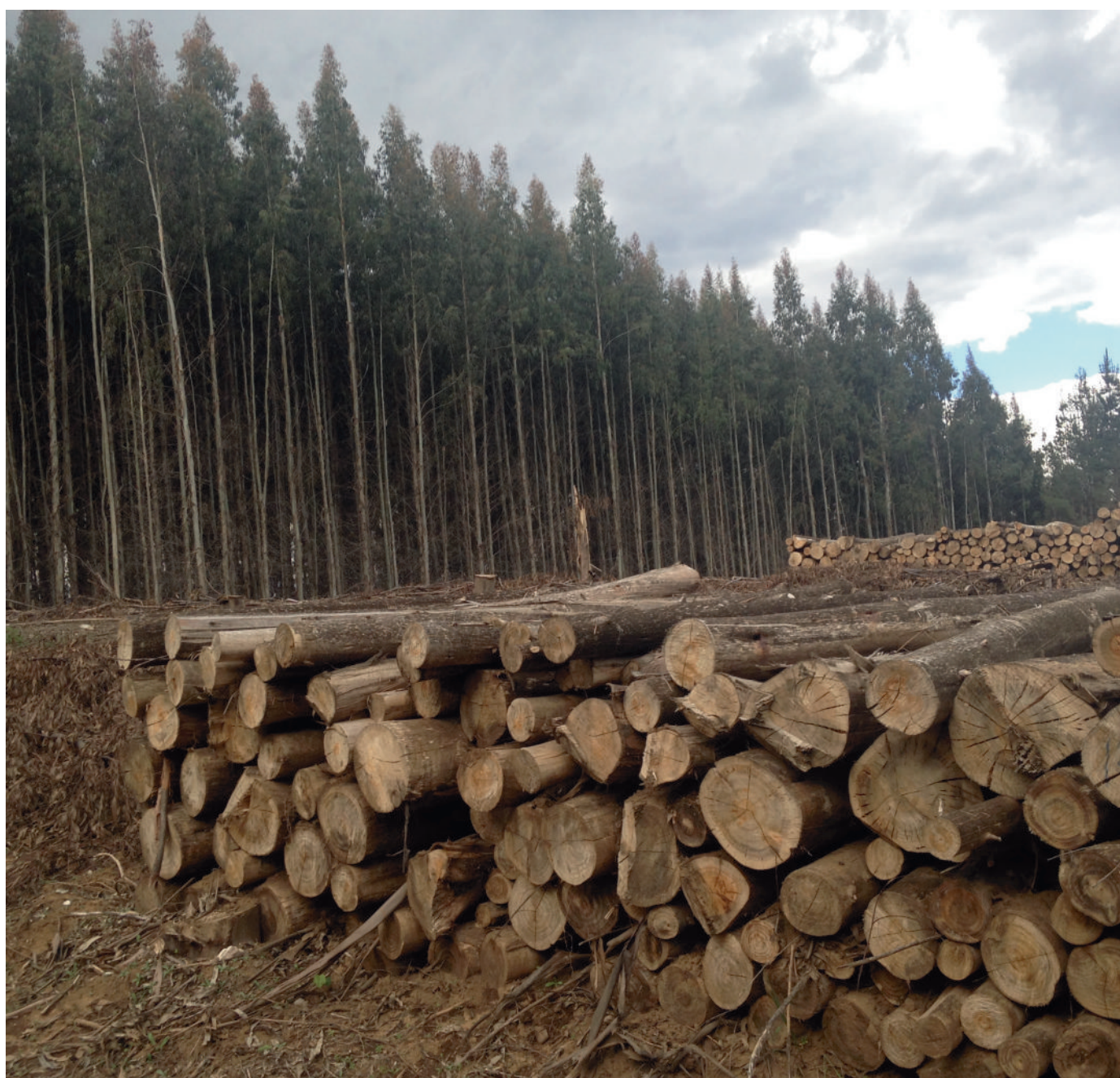
Tree plantations in Chile have caused serious conflicts with local communities. Simone Lovera

able to compensate their greenhouse gas emissions by tree planting and other carbon sequestration projects. But this will clearly add insult to injury. More plantations will bring more environmental and social problems, and will undermine the already weak climate regime, especially since trees are such unreliable carbon stores.