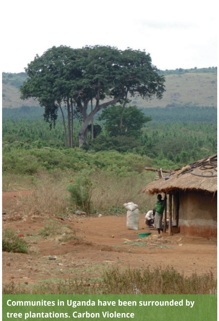
Communities in Uganda have been surrounded by tree plantations. Carbon Violence

For example, when one reads Green Resources' website it portrays itself as a company intent on improving community livelihoods. But in reality it is the reverse. As it also says on its website: "Green Resources is Africa's largest forestation company and a leader in East African wood manufacturing. The company has 45,000 ha of standing forest in Mozambique, Tanzania and Uganda, established through its own planting