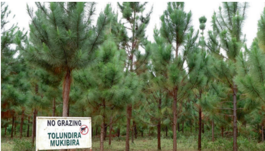
Communities excluded from land they would have grazed animals on. Carbon Violence

Green Resources is also clearly targeting the additional finance streams available in terms of bioenergy and bio-chemicals made from forest products, and climate finance: "Green Resources holds land enabling the company to establish close to 200,000 ha of additional plantations with an aim to serve the growing regional and global demand for wood products. Its strategy is based on growing wood for both traditional uses (sawn timber, panel board, packaging, tissue, etc.) and for the growing bio-chemical and energy sectors. It is a leader in carbon finance with four validated reforestation projects." [2]