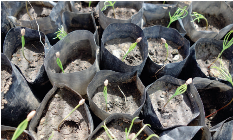
Green Resources pine seedlings in Uganda. Carbon Violence

activities. It operates East Africa's largest sawmill in Tanzania and electricity pole and charcoal plants in Mozambique, Tanzania and Uganda and is also one of the first companies globally to receive carbon revenue from its plantation forests". [1] What do communities benefit from this? Especially given that most of the areas occupied by the plantations were formally community land or government land.