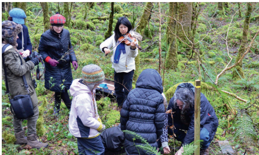
Planting an oak tree in 2014, in Raheen oakwood to commemorate the fact that it is 1000 years since the death of the last High King of Ireland, Brian Boru.

the four acre site to the local community, asked us to help him conserve a further 40 acres of his ancient oak wood, based on what we had achieved with his gift of four acres. We guided him to commission a Sustainable Forest Management (SFM) plan, which he did, and then he surprised us by adding another 200 acres of his estate into the plan. This is now the largest private native oak forest restoration project in Ireland.