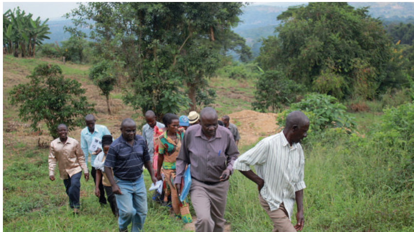
A transect through Kikandwa communities as part of the Uganda CCRI. NAPE/CIC

CCRI initiatives are being conducted and promoted in Tanzania, Kenya, Uganda, the Democratic Republic of Congo and Ghana. It is important to note that