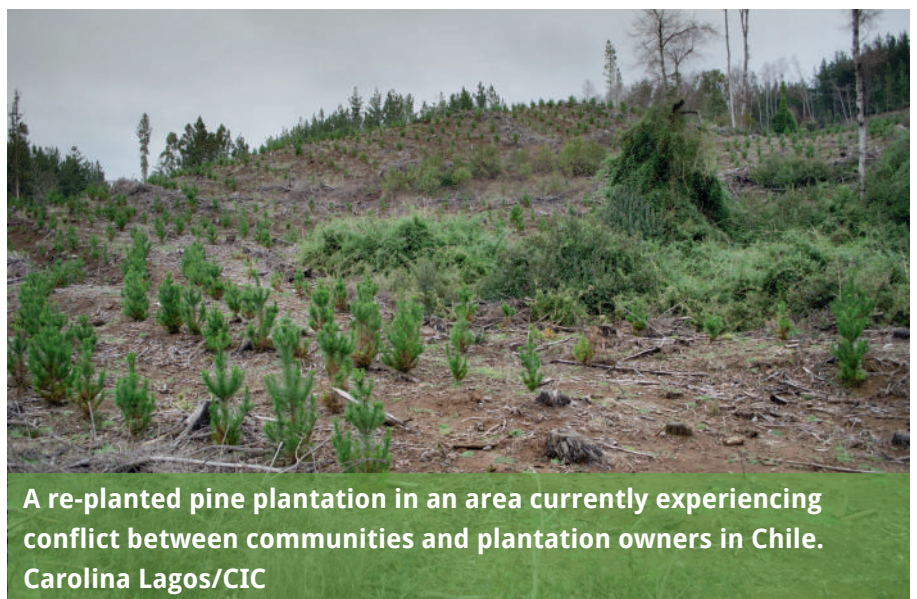
A re-planted pine plantation in an area currently experiencing conflict between communities and plantation owners in Chile.

decree did attempt to reverse this trend, but looked at in the round over 40 years, it is still clear that 70% of the profits have gone to large and medium enterprises. As a result, just three holdings are now receiving more than 70% of the profits generated by the exports in this sector, and the same groups are owners of more than 67% of the plantations. [2]