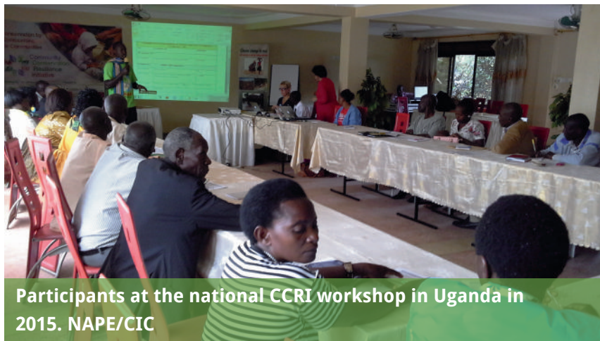
Participants at the national CCRI workshop in Uganda in 2015.

because large tracts of land have already been given out to plantation companies. The disgraceful way in which corporations have treated communities as mentioned above has also triggered forest loss and therefore climate change,