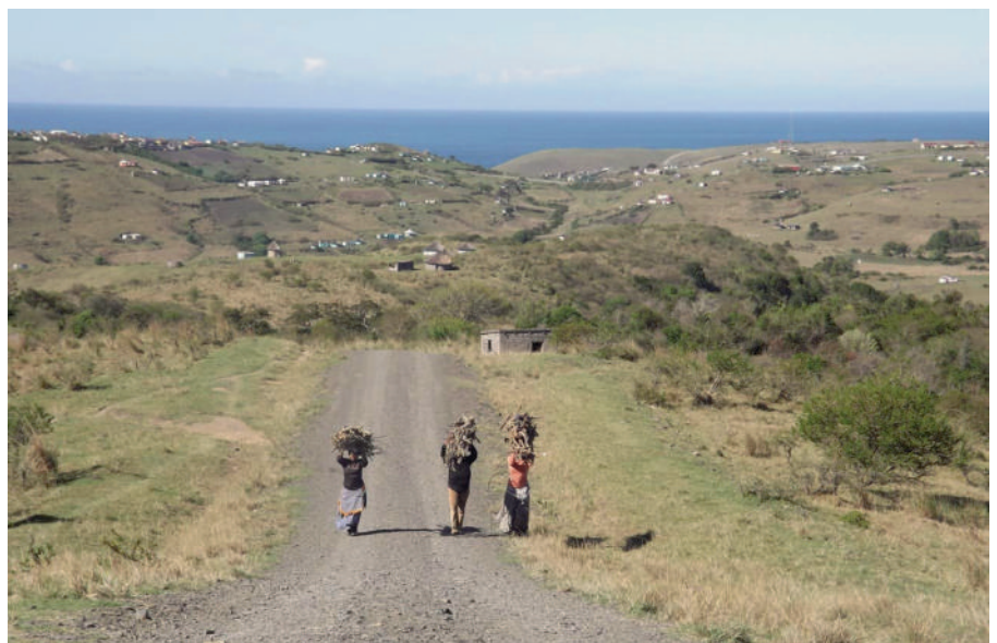
Women in South Africa making the daily journey to collect firewood.

Furthermore, more time spent on these mundane tasks means that there is less time available for education, which also impacts on women's capacity to participate in decision-making, with respect to land use and forest management for instance. At the same time, having to travel longer distances also increases the risk of physical