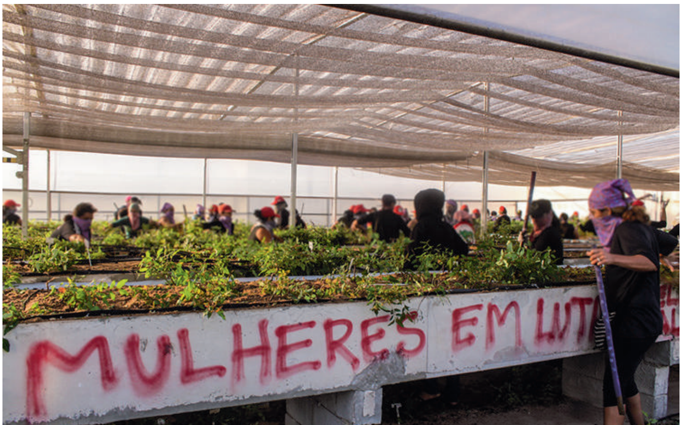
Women of the MST occupy Suzano's eucalyptus facility in Brazil in 2015. MST

A similarly inspiring example occurred in 2015 when about one thousand women broke into a FuturaGene facility in Brazil and ripped up genetically engineered (GE) tree seedlings. The women made clear their determination to prevent the release of GE eucalyptus because they have direct experience of the harm resulting from existing large