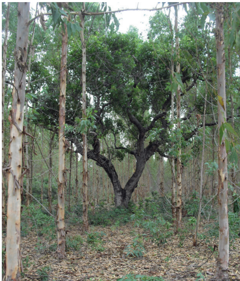
A culturally important Pequi tree in Brazil's Maranhão state is fenced by monoculture eucalyptus trees. Winnie Overbeek

alien species like Eucalypt and pine, the second part of SDG target 15.2—to substantially increase reforestation and afforestation—forms a significant direct threat to the other parts of the same SDG target, which call for the conservation of terrestrial ecosystems.