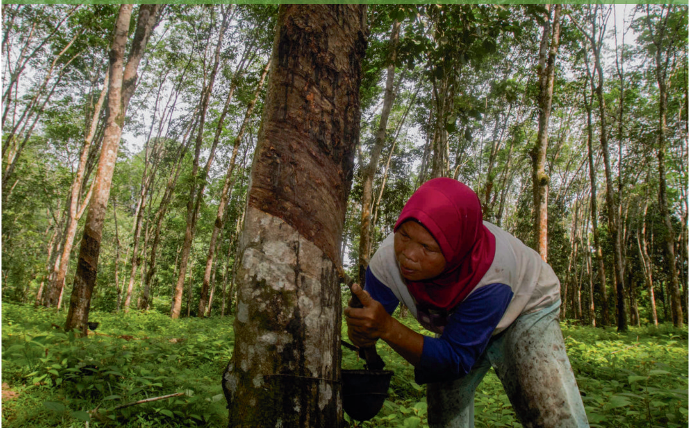
A woman taps a rubber tree on her farm in Jambi province, Indonesia.

Therefore, even though Gender Action Plans and Gender Decisions may strive for better inclusion, the reality is that the overall agreements are, at the same time, advocating for issues that will definitely continue to have strong negative impacts on women's lives and livelihoods.