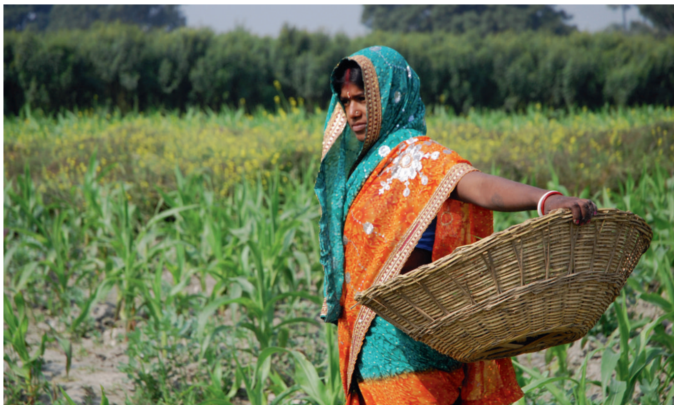
The livelihoods of small-scale farming communities, such as this farmer in Bihar, India, are at risk from the expansion of tree plantations.

which is essential to the notion of decentralised governance, is diluted by this convergence, because CAMPA is strongly centralised at both the central and state government levels, and fully controlled by the forest departments. It is essentially a fund based on payments for compensatory afforestation and Net Present Value (calculations arrived at by putting a certain monetary value to the area to be deforested for a project) made by developers whose projects will destroy forestland. By the end of 2015 this fund reportedly amounted to Rs.40,000 crore (US $6 billion).