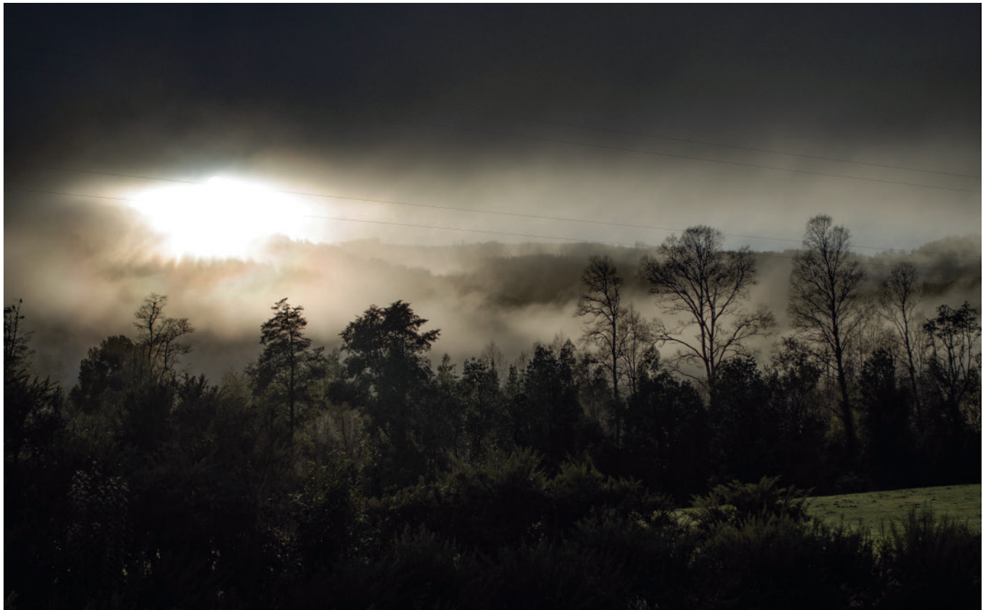
A community forest in Chile on a winter morning.

ensure the conservation of our indigenous peoples' cultures, which have been intimately linked to the forests throughout history.