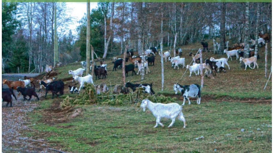
An example of sustainable pastoralism in the Alto Bio-Bío region, Chile.

period, even in regions with annual average rainfall of 1,200 mm. Due to this, regional governments have been forced to supply water to communities by shipping it in in trucks. However, this supply is limited and only meets the needs of human consumption. There are therefore severe impacts on animal breeding, crop production, and the propagation of native species for medicinal use and for forest conservation and restoration. This makes plantation forestry the main threat to cultural and ecosystem conservation from peasant and indigenous communities' perspective, and problems related to this have been the cause of escalating conflict with the