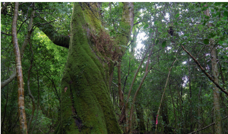
Dancing Goddess oak tree in Raheen ancient oak wood.

Ireland was the first British colony and the model for future colonisation. This period between