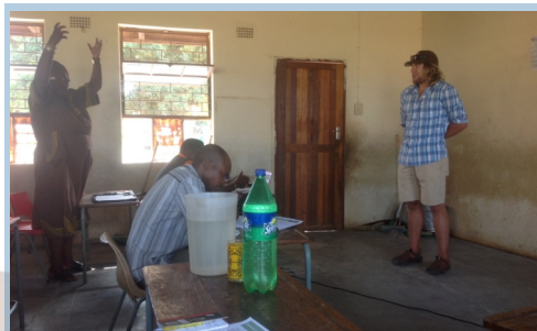
Participants at the Mariepskop CCRI workshop.