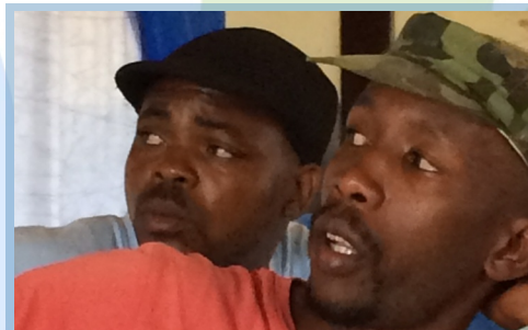
Participants at the Mariepskop CCRI workshop.