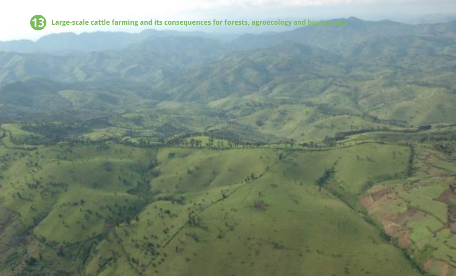
The lines of old fields can be seen from above in what are now pastures for cattle in Masisi. Competition for land between herders and farmers is one of the factors fueling instability in North Kivu.