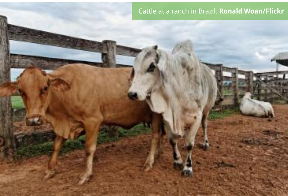
Cattle at a ranch in Brazil.

Cattle rearing in Brazil was boosted further in the 1970s, especially in the Central-West region, with the expansion of the country's agricultural frontier and the implementation of the "Green Revolution" in agriculture, which was established by the military regime then in power. As part of this, the state subsidised a series of large-scale agricultural, livestock and infrastructure projects in Central Brazil to attract rural entrepreneurs from the South and Southeast of the country.