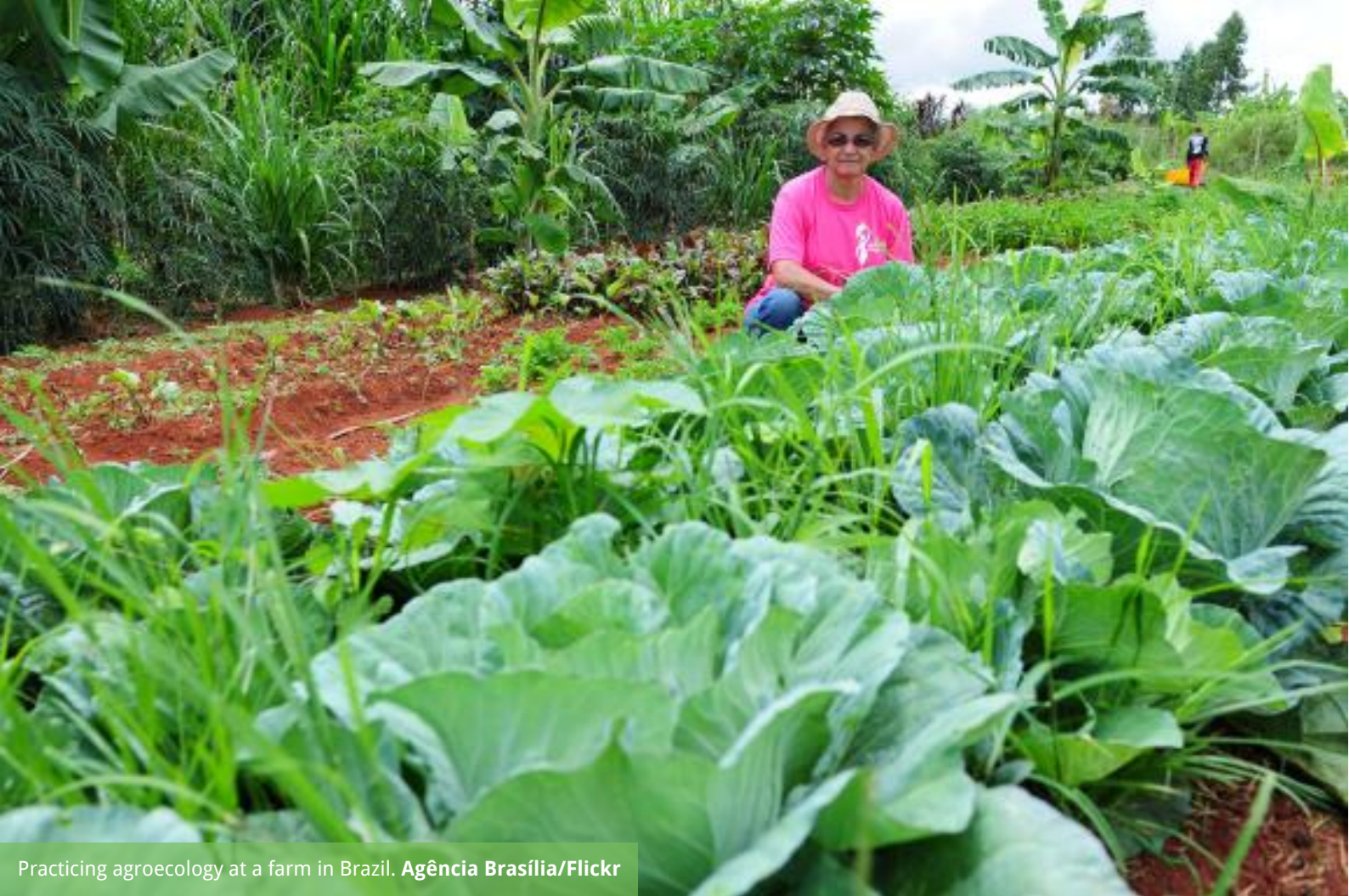
Practicing agroecology at a farm in Brazil.

Together, these case studies deconstruct the myth that large-scale, industrial agriculture is 'feeding the world', and that it is compatible with other more sustainable and equitable forms of food production. One model clearly comes at the expense of the other. Big agribusiness has captured international and national-level agricultural and trade policy-making, which continue to push this unsustainable agro-industrial model by providing incentives in the form of direct and indirect subsidies. [6] Cleaner forms of production, such as agroecological models and traditional peasant agriculture, lack appropriate forms and levels of support.