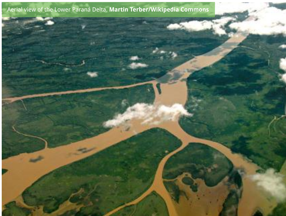
Aerial view of the Lower Paraná Delta.

companies, [1] along with closed systems for water management, have a greater impact on the natural waterways, both structurally and functionally, than the open systems used previously.