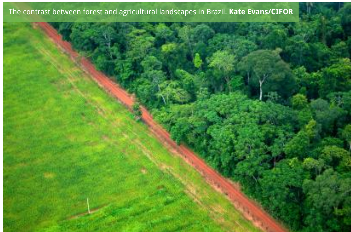
The contrast between forest and agricultural landscapes in Brazil.

At the same time, the current government is financially suffocating rural organisations, especially those that implemented public programmes, and has also indicated that it could frame social movements fighting for agrarian reform as terrorist organisations. In this context, industrial livestock farming and agribusiness in its most destructive forms finds itself in an environment of impunity, with nothing to hold back its desire for expansion while, on the other hand, agroecological systems are increasingly squeezed out by this model.