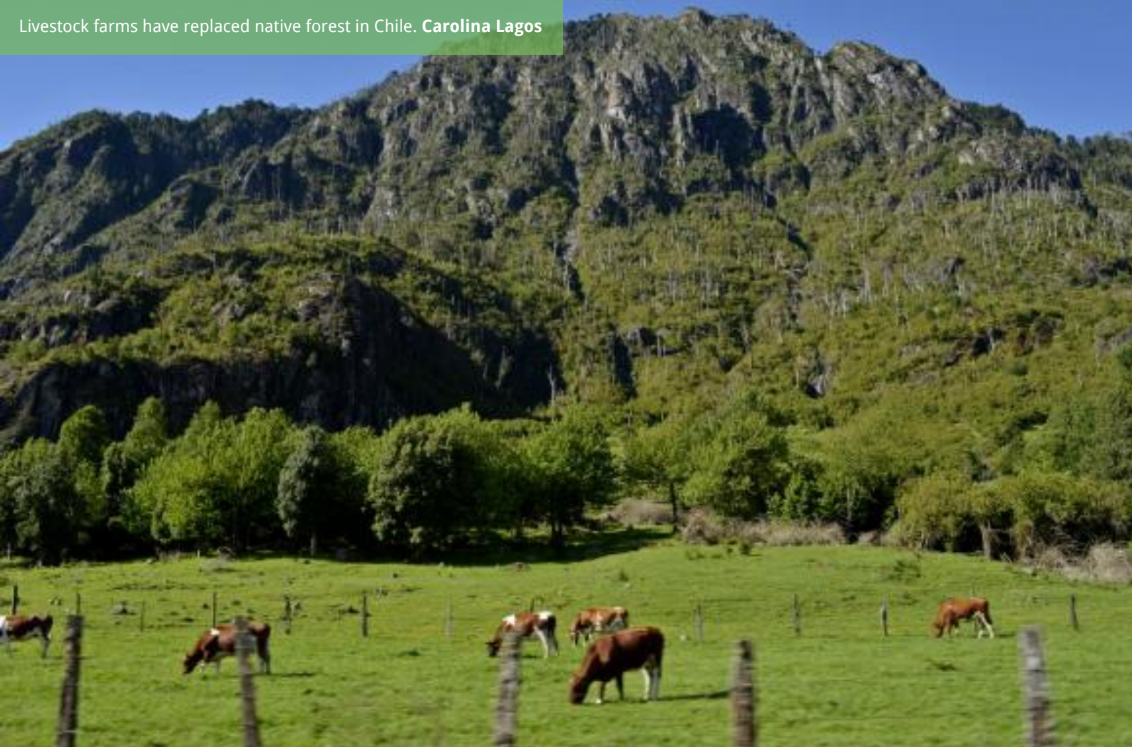
Livestock farms have replaced native forest in Chile. Carolina Lagos