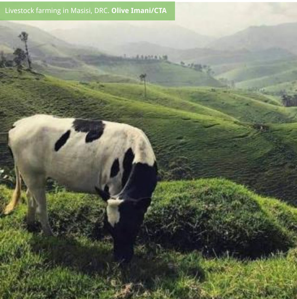
Livestock farming in Masisi, DRC.

The increase in the number and size of farms and pastures has been the greatest cause of forest loss in Masisi territory, and 60% of the area has now been deforested. This has caused substantial changes to the ecology and climate of the region, with the loss of habitat resulting in a significant loss of species. Poor planning and land use management, coupled with unsustainable resource management, has degraded soils and put pressure on wood and timber resources. Conflicts have occurred over the use of land, and