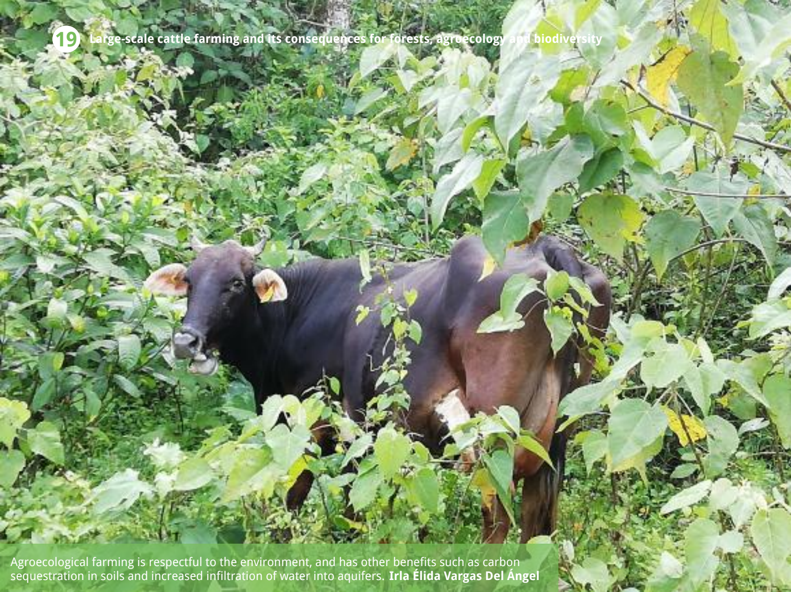
Agroecological farming is respectful to the environment, and has other benefits such as carbon sequestration in soils and increased infiltration of water into aquifers. Irla Élide Vargas Del Ángel

Given the pressure on land and natural resources by calf production for this agribusiness model, farmers must abandon other types of production, such as milpa , an indigenous ancestral practice, which involves growing different species interspersed with each other (fruits, medicinal plants, maize, beans, pumpkins, sweet potatoes, and some herbs).