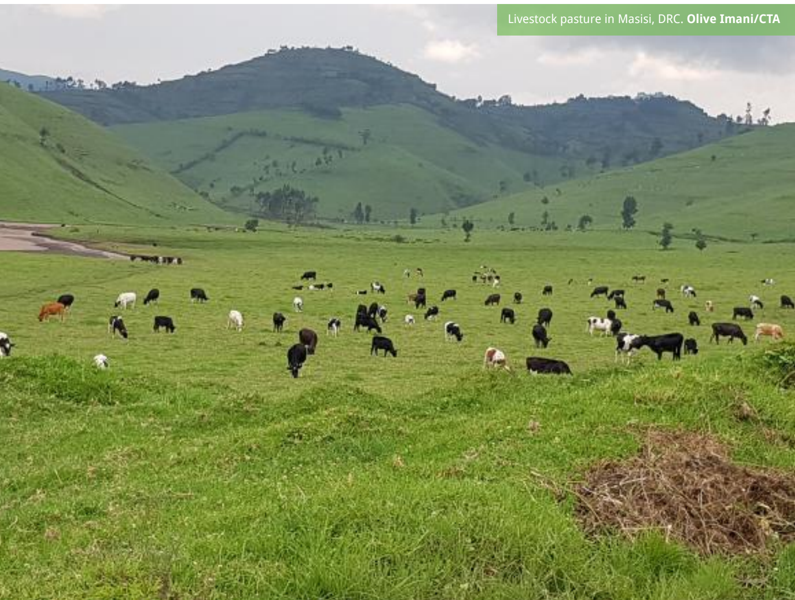
Livestock pasture in Masisi, DRC.

Agricultural Research (INRA-SAD) and whose research focuses on the working relationship between humans and animals, explains that traditional breeders have a much more humane relationship with their animals. They know them individually, and their central aim is not an obsessive maximisation of profit, so the animal is not reduced to a "commodity" that can be exploited mercilessly.