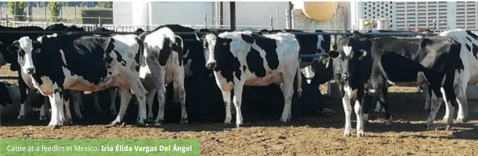
Cattle at a feedlot in Mexico. Irla Éliða Vargas Del Ángel

ecosystems are under threat from the industrial livestock model, and where local, small-scale, traditional and agroecological systems of food production are either being squeezed or stamped out by it. Case studies from Argentina, Brazil, Chile, Mexico and Paraguay highlight how big agribusiness is given free-reign over land and the lives of peasant farmers and Indigenous Peoples in Latin America because of the vast political support it receives. Meanwhile, a case study on North Kivu, Democratic Republic of the Congo, shows how imported models of large-scale cattle rearing conflict with traditional alternatives and cause deforestation of tropical forests in Africa.