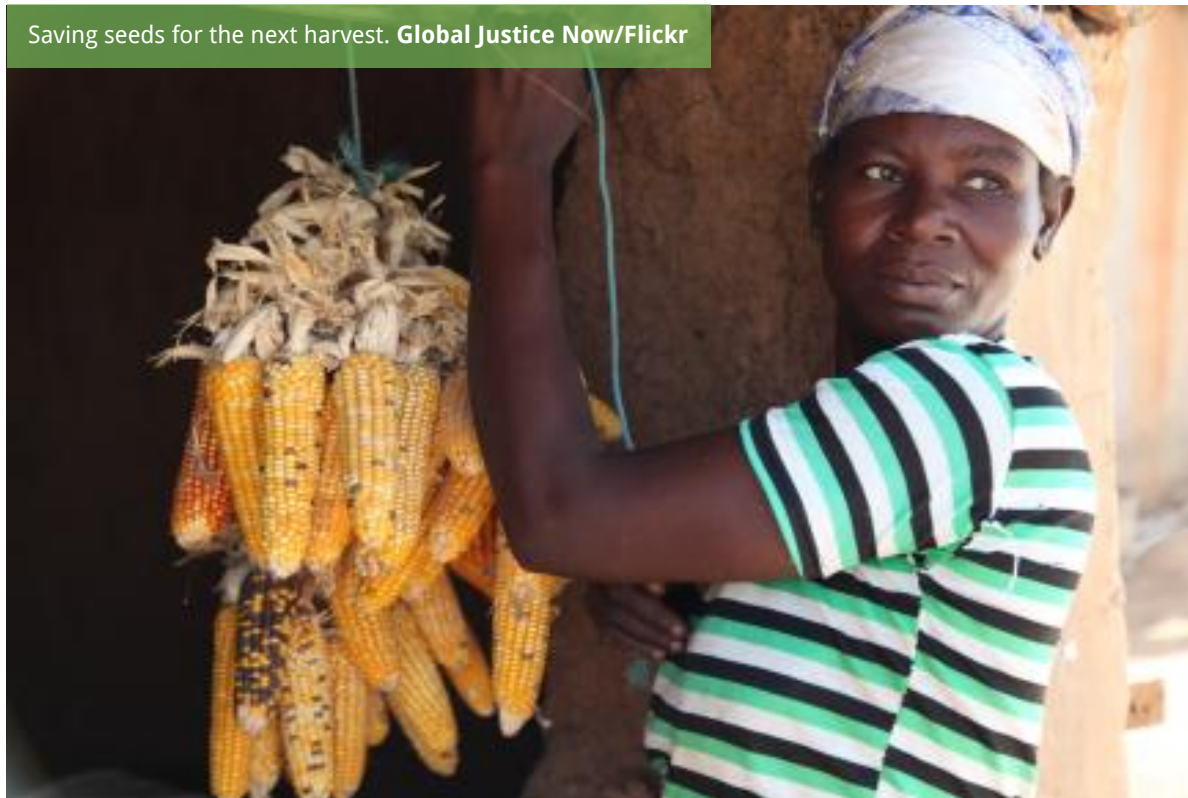
Saving seeds for the next harvest.

promotes overconsumption and food waste and is dependent on synthetic inputs, we must strive for a just model based on traditional methods of production, ensuring balanced and sufficient diets for all, promoting rural autonomy and self-sufficiency, and allowing food producers to live healthy, safe and dignified lives.