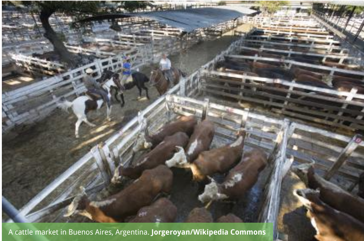
A cattle market in Buenos Aires, Argentina.