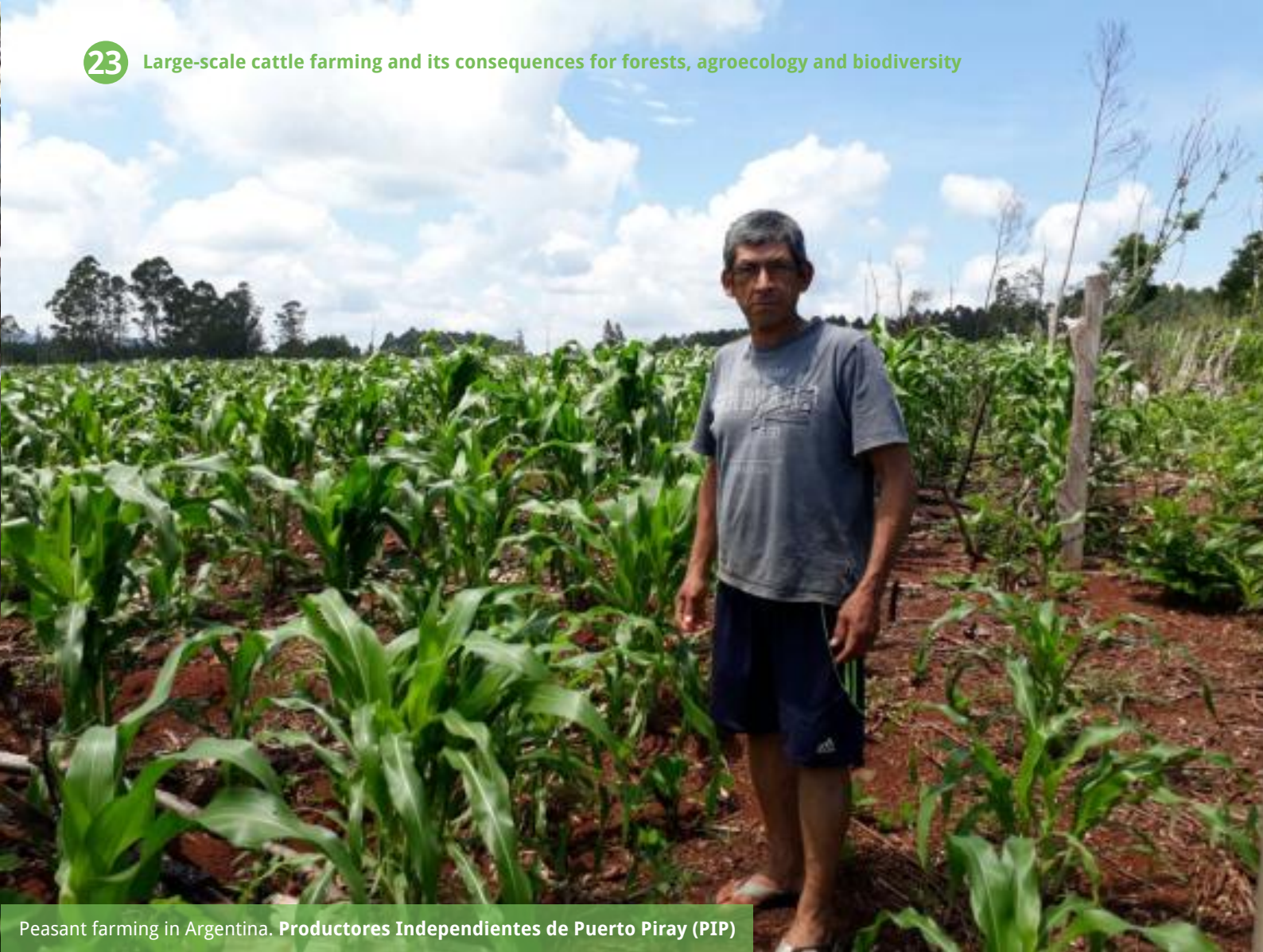
Peasant farming in Argentina. Productores Independientes de Puerto Piray (PIP)

medium scale. Reeds are the star crop, being native and used traditionally, along with willow and bamboo, which are exotic species that are also sold. Beekeeping is another activity that is flourishing in the Delta. Fish farming in small establishments and hydroponic plant nurseries are other options.