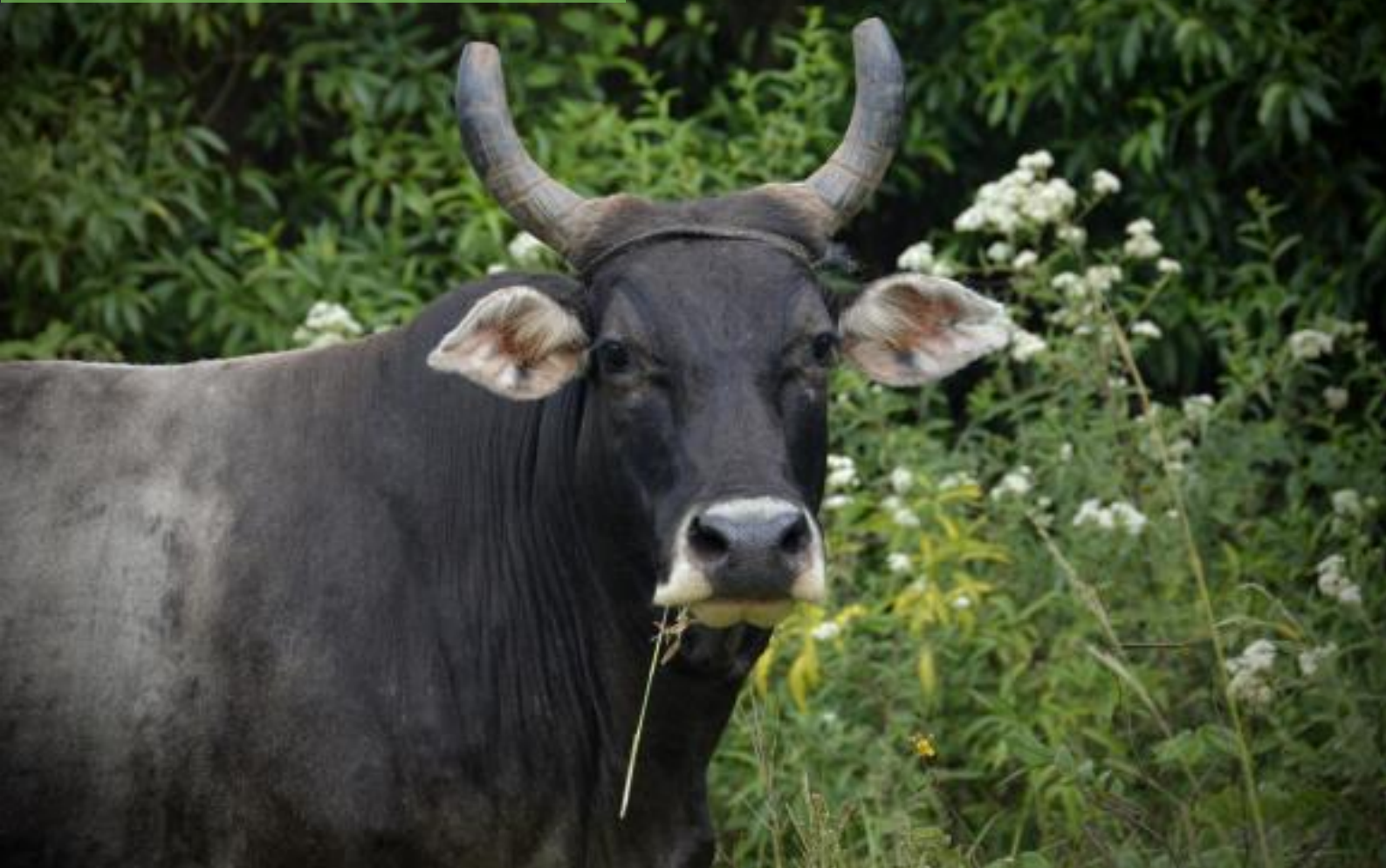
Traditional livestock farming in Paraguay. Inés Fransceschelli