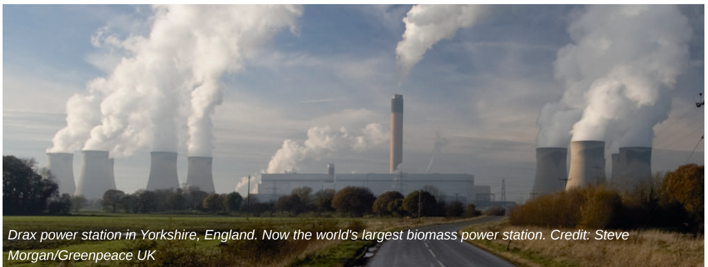
Drax power station in Yorkshire, England. Now the world's largest biomass power station.

The US lags behind Europe, the US's draft 'Clean Power Plan', which is due to be finalised by 1 June 2015, gives states a mandate to reduce emissions using a variety of 'building blocks', which include renewable energy resources. The plan is poised to incorporate the assumption that burning biomass reduces emissions, which would inevitably lead to a wave of new coal plant and biomass facilities. The southern US is already the leading