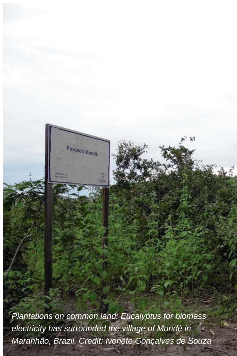
Plantations on common land: Eucalyptus for biomass electricity has surrounded the village of Mundé in Maranhão, Brazil.

The meeting called for campaign agendas to be developed around