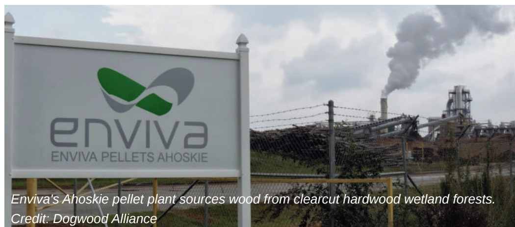
Enviva's Ahoskie pellet plant sources wood from clearcut hardwood wetland forests.