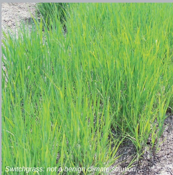
Switchgrass: not a benign climate solution.

( http://link.springer.com/article/10.1007%2Fs10584-012-0682-3#page-1 ).