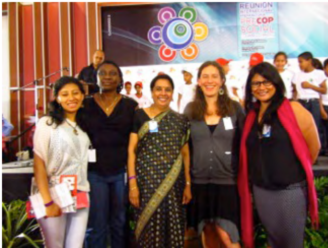
Women and Gender Constituency at the Social PreCOP.

During the four days I actively engaged in connecting with our indigenous colleagues at the Social Pre-COP to collectively strengthen and articulate the engagement of indigenous peoples in various sessions during the meeting.