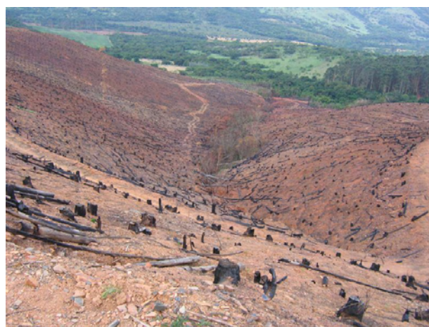
FSC certified ex-grassland.

In conclusion, the FSC, as with any system invented by human beings, is not perfect. A key lesson here is that standards, even very strict and detailed standards, will never work properly without constant and professional pressure, especially from civil society and local communities. Its efficacy will continue to depend on all of us, those of us who live with the forest, by the forest, for the forest or thanks to the forest.