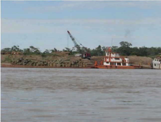
Logs ready for export in the Peru Amazon.

Nevertheless throughout the years we have challenged, and will continue to challenge that agenda. GFC has brought the messages of hundreds of Indigenous Peoples' Organisations and NGOs engaged at all levels to COFO. They have collectively challenged the reductionist paradigm that seeks to secure unrestricted private sector access to the treasures of the forests and their peoples. Many would like to see these critical issues on the formal agenda.