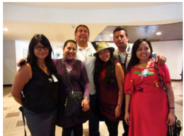
Indigenous delegates at the Social PreCOP.

From September to November the plan is to include more views and perspectives into the Declaration and strengthen it further at the second Social PreCOP meeting in Venezuela in November, where more representatives are expected to attend. The Declaration will be further refined, making it more focused and inclusive, enabling greater mobilisation and impact as a result. The final Declaration will be presented at COP 20 of the UNFCCC in Lima, Peru in December 2014.