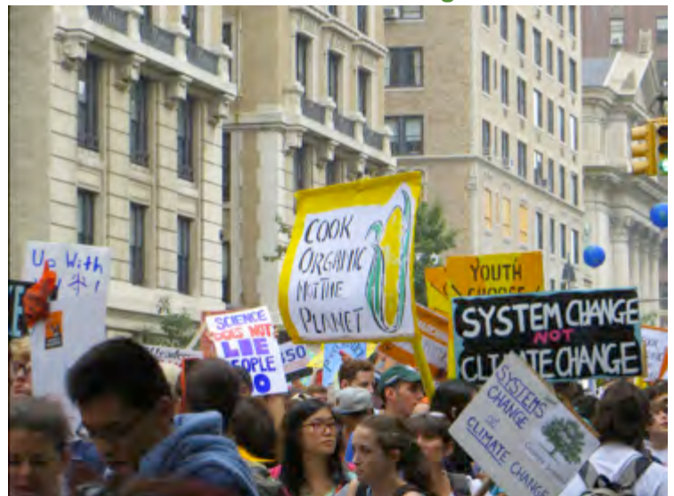
People's Climate March in New York.