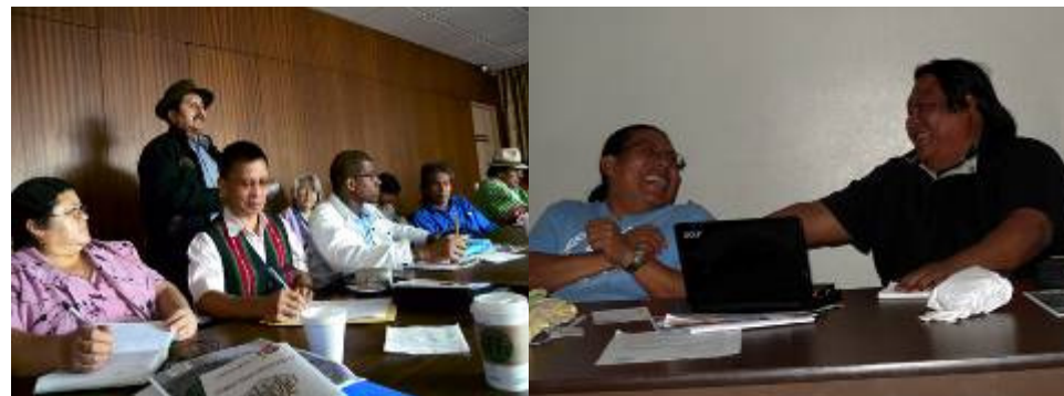
Capacity building workshop during UNPFFI.

The ninth Conference of the Parties to the UN Convention to Combat Desertification (UNCCD COP 9) will convene in Buenos Aires, Argentina, from 21 September to 2 October 2009. For more information, please visit: http://www.unccd.int