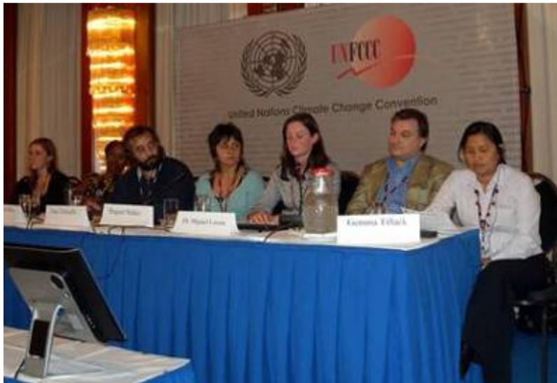
Press conference "Survival: Stop Deforestation, Industrial Logging and Plantations" organized by Global Forest Coalition.