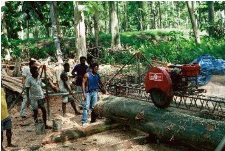
A portable sawmill training, Papua New Guinea

Negotiations in the Ad Hoc Working Groups on Long-Term Cooperative Action (AWG-LCA) and on the Kyoto Protocol AWG-KP (held in parallel, 1-12 June, in Bonn) stalled due to the lack of political will amongst the parties. The participation of Indigenous Peoples' representatives was extremely difficult and our proposal failed to receive support from a single government, meaning that it could not be considered part of the negotiation text for the next meeting of the working groups.