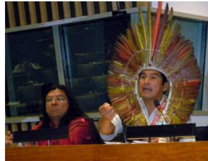
Panel members at UN Permanent Forum on Indigenous Issues, New York, May 2009.

The other seemingly immovable boulder barring the way is these same countries' resistance to sensible proposals about how to mitigate climate change, as well as adapt to the inevitable! It seems that money is more important than the planet's climate: any argument that might 'cost too much' is met with a stony resistance that would put a solid rock wall to shame. Negotiators from developed countries typically argue that their economies will be ruined if they agree to these proposals. They do so without the slightest hint of guilt or discomfort, ignoring the cries of those whose homes and lands are disappearing beneath the waves, of those dying because of climate-induced thirst, hunger and natural disasters. Lamentably, the commendable traits that we saw in early environmental negotiations, of compassionate and collegial understanding, seem to have faded away completely. Negotiators will only entertain profit-generating false solutions.