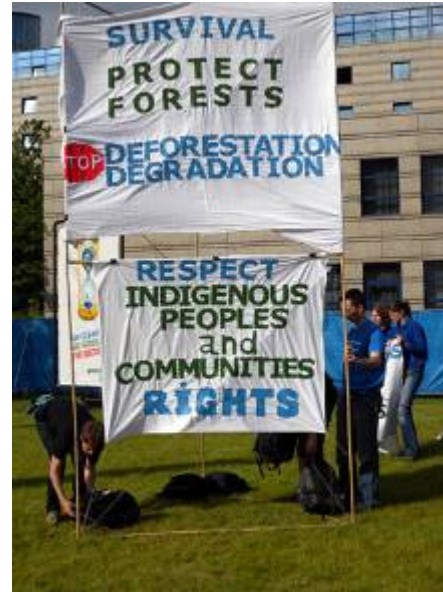
Morning protest to negotiators as they go into UN Climate Talks in Bonn, Germany.